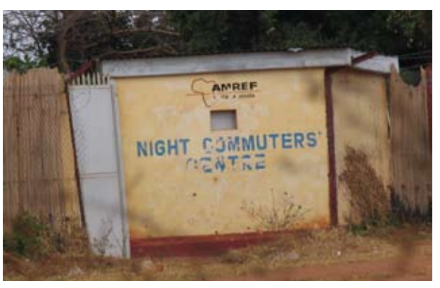
Night commuters' centre, Gulu