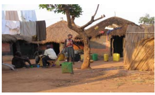
Koro Abili IDP camp, Gulu district